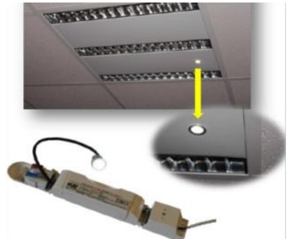
Mini Luciole Version